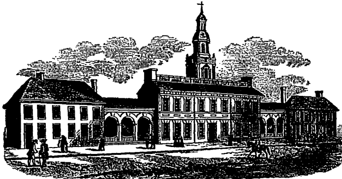
THE STATE HOUSE, PHILADELPHIA, IN 1776.

Williamsburg, a "Convention of Delegates from the Counties and Corporations in the Colony of Virginia." I have before me the Journal of that Convention, and from the record of Wednesday, May the 15th, I copy the following :