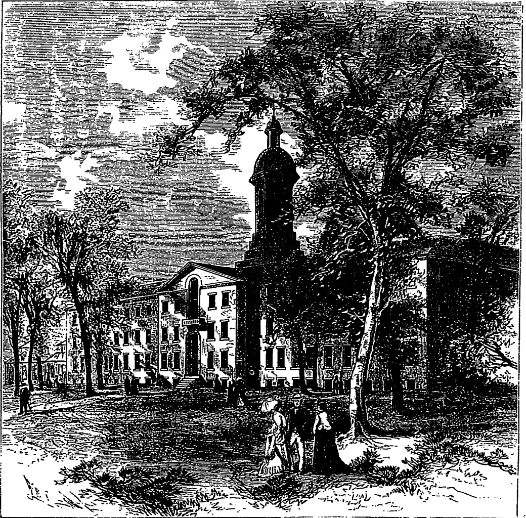
NASSAU HALL, COLLEGE OF NEW JERSEY, PRINCETON.