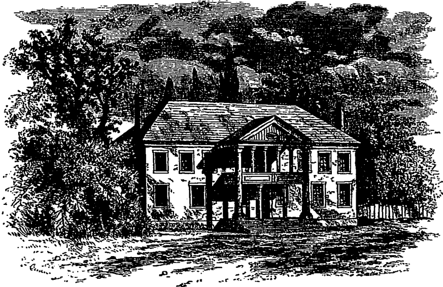
THE OLD CAPITOL OF VIRGINIA.

ONE HUNDRED YEARS AGO—who can in imagination go back and fully comprehend, vividly realize the stirring events that prepared the way for the birth of our glorious “land of the free, and home of the brave?” Much less can we thus go back and comprehend the intense loyalty to the King and to the nation of Great Britain that induced our patriot fathers to exhaust every alternative in the form of appeal, remonstrance and protest, ere they took up arms in defence of their rights and liberties—still less can we understand how that loyalty survived for months after the actual appeal to arms, and caused our patriot fathers long to cherish the hope of reconciliation and of a return to their old charter relations as Colonies of the British Empire. Many battles had been fought, very many lives offered up, ere the first thought of independence was developed into utterance—and then slower than leaven was that thought in working its way through the minds of the patriot masses, and betraying itself into action.