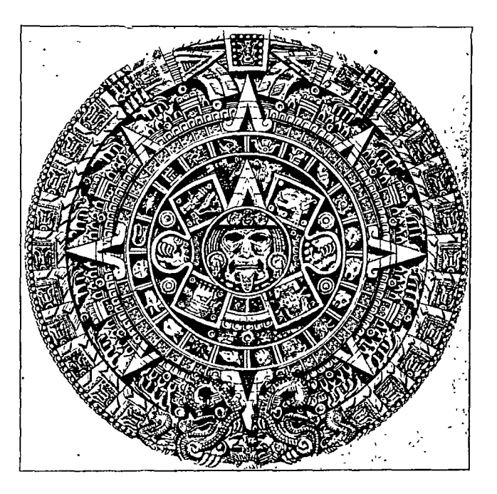
Fig 3-AZTEC CALENDAR STONE.*

There is another story of the Flood, which prevails among the Aztecs, and is perpetuated by the Calendar Stone, a stone in which the serpent is seen upon the circumference; in the center of which is the face of the sun, and four towers or