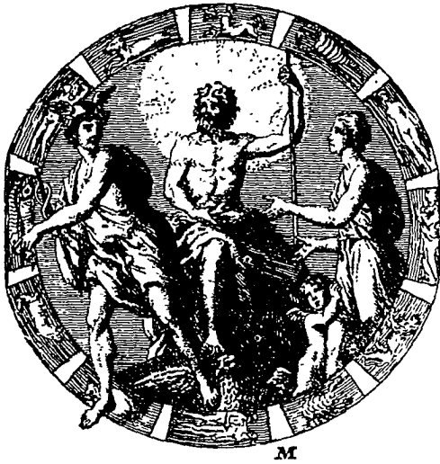
Fig. 4 -- CONSTELLATIONS AND GREEK GODS.*

There are, in connection with these stories, contests which resemble that of the two brothers as given in the Scriptures. These brothers contended with one another before they were born, as Esau and Jacob contended. Glooskap, who was worshipped afterward by all the Wabenaki, or children of light,